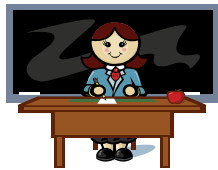
Teachers at the center!